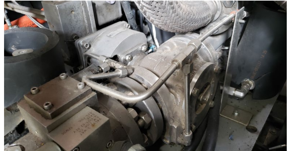
Natural Gas Valve