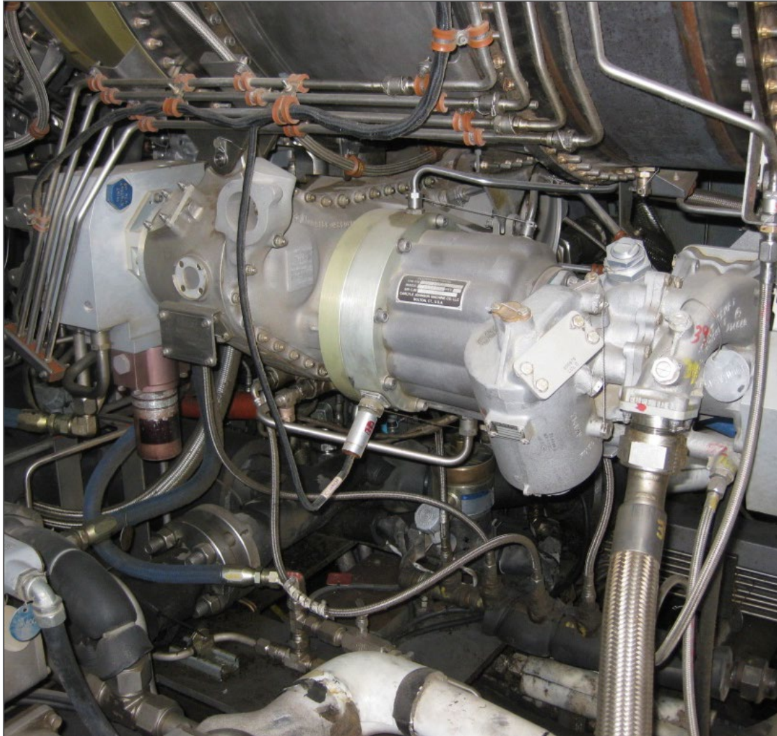
Liquid Fuel Valve