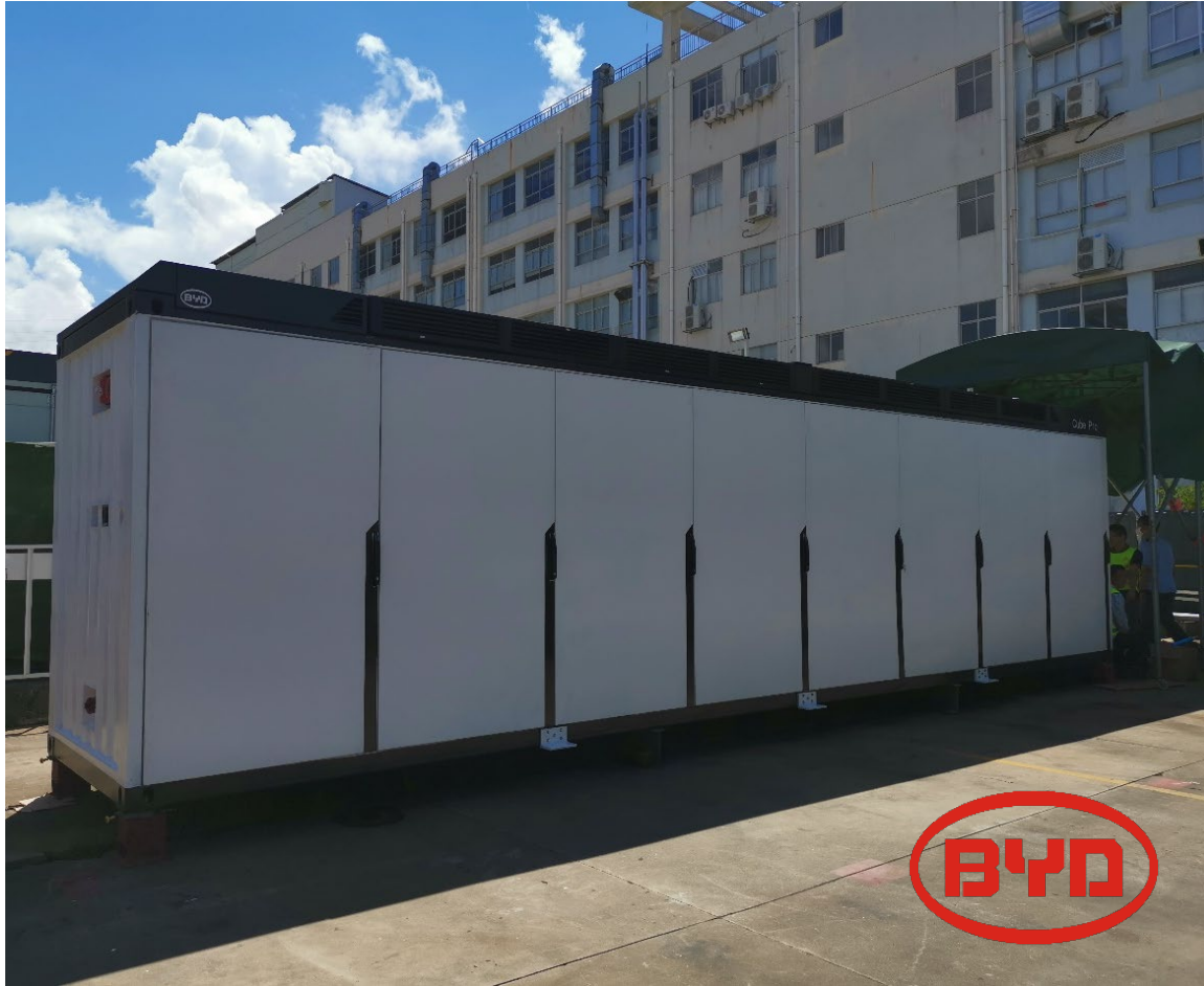
Example of BYD CubePro