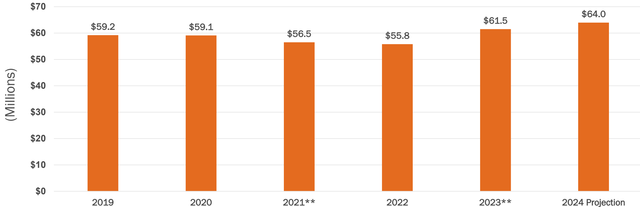
Annually Required Contributions (ARC)*

* Per policy, the District annually funds Aon's determined ARC each year