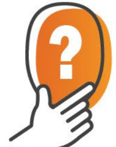
Culture of curiosity