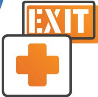
Locate AED's, exits and first aid