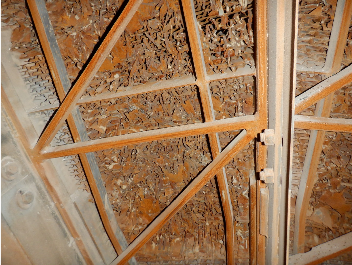
2021 OUTAGE INSPECTION